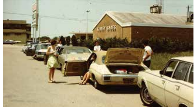
Car caravan to Guatemala

Multiple new initiatives grew out of the program that summer. The first was a trip to Guatemala to visit the communities among whom the Winter family had worked for 10 years. Twenty-two SIIS students piled into seven old cars and drove non-stop from Wheaton to Guatemala. Along the way, we visited a “committed community” somewhere near the Mexican border.