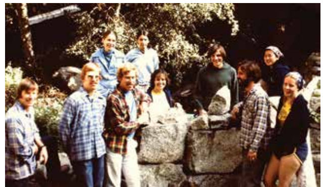
Haggai community retreat