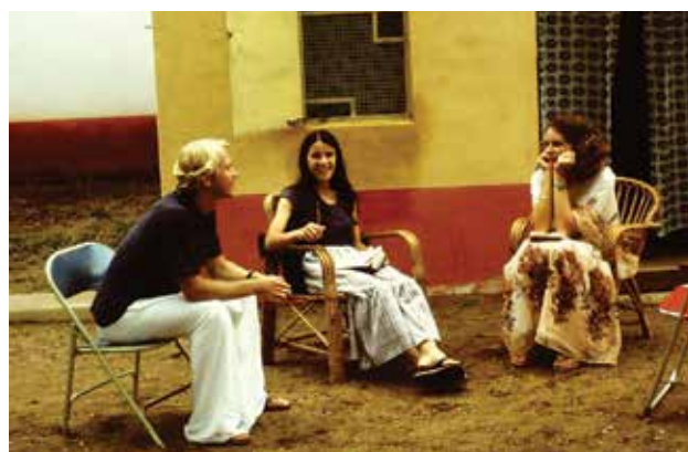
Advanced Institute of International Studies 2