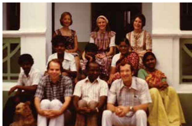
First Advanced Institute of International Studies