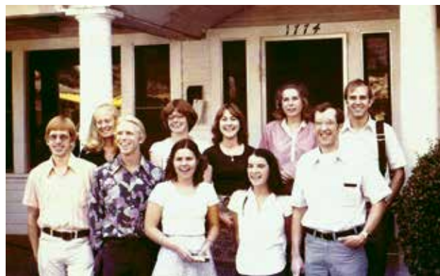
Haggai community India team

Looking back, we can see how significant it was that an older generation invested in us, a younger generation impacted by spiritual vitality across the USA in the early 1970s. We found a way to study world missions in community for concentrated periods.