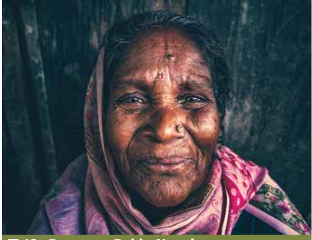
■ 12 Danuwar Rai in Nepal

If you believed you had Hindu goddesses as ancestors, would it be hard to break away from Hinduism? That is the situation for the Danuwar Rai people of Nepal. Collectively, the Rai are known as a very courageous, daring and fearless people. In recent history, they have won worldwide respect for their bravery in the Royal Nepalese Army. Joining the army is often a way out of enduring economic hardship.