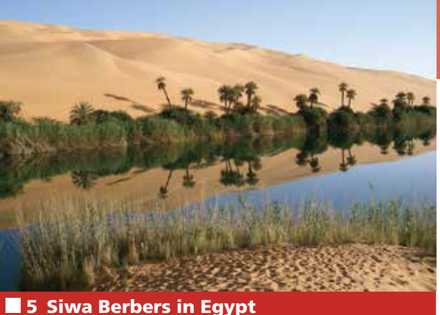
5 Siwa Berbers in Egypt

The Siwa people mostly live in the Siwa Oasis, a remote desert location in the far west of Egypt, close to the Libyan border. A road was built in the 1980s from this oasis to the Mediterranean coast. The people are culturally closer to the Berbers of Libya than they are to Egyptians, and they have their own language. Tourists visit the Siwa Oasis; this offers interesting possibilities insofar as bringing the gospel to these people.