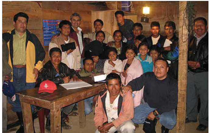
Kekchi receiving Proclaimer