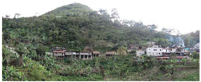
Kekchi village in Guatemala