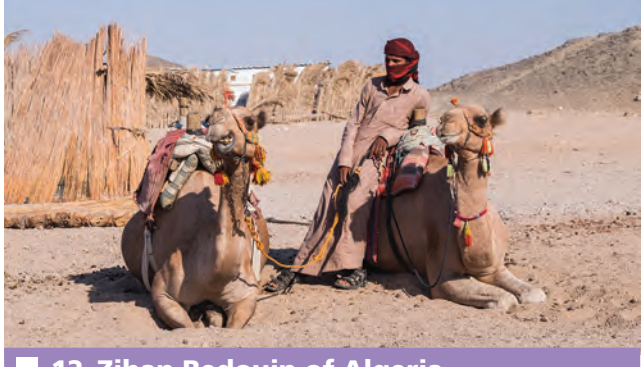
12 Ziban Bedouin of Algeria

Ziban Bedouins are a nomadic people who know how to find water in the desert for their livestock. If they break the rules of their society each clan selects a sheik to determine whether they are guilty. They consider it to be below their dignity to be forced to live settled lives and become farmers. However, many Ziban are being forced to adapt to a more sedentary life, especially as their region becomes dryer.