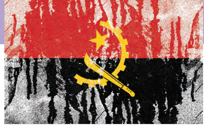
Even though I walk through the valley of the shadow of death, I will fear no evil, for you are with me; your rod and your staff, they comfort me. —Psalm 23:4