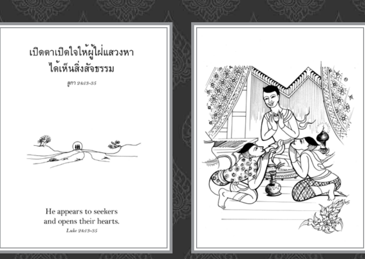
When Jesus raises a cup of water, the two followers suddenly recognize who he is. The water container in the front is northern Thai style. Water is drunk at the end of the meal in Thailand. Water is also a symbol of life.