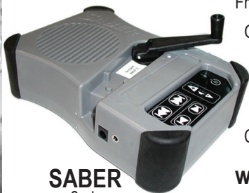
SABER mp3 player