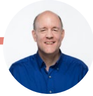
BY RICK WOOD EDITOR OF MF