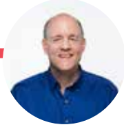
BY RICK WOOD EDITOR OF MF