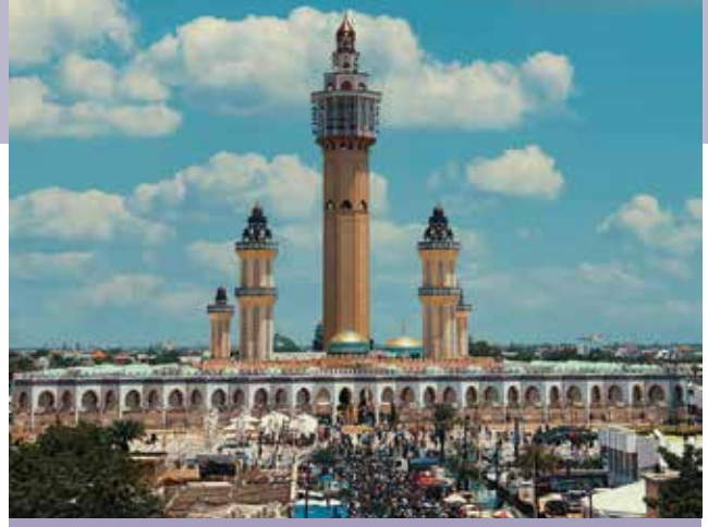
3 Moors in Senegal

Moorish society is primarily nomadic and is organized into successive ranks of tribes, clans, sub-clans, and tent units. Several tribes form a tribal alliance. The Moors are a very proud people, conveying a sense of superiority to others in the area. Pride is a serious barrier to the gospel of grace.