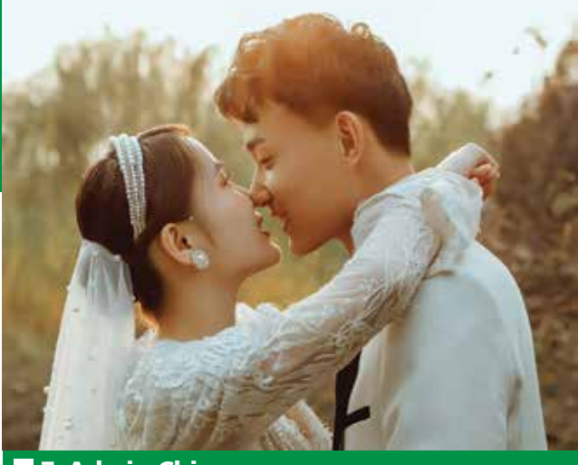
7 Adu in China

Today most Adu youth choose their partners. It is essential for a young Adu man to own certain possessions—like a TV, a motorbike and a refrigerator—to be considered attractive. The majority of Adu under the age of 40 are nonreligious. At most they observe customs relating to ancestor worship.