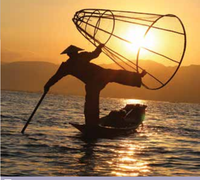
■ 18 Intha in Myanmar

You have probably rowed a boat with your arms. How about using your feet? The Intha people row their boats with their feet so that their arms are freed to work on other things. The Intha live in central Myanmar in or on Inle Lake. Fishing and agriculture are the main occupations of the Intha people.