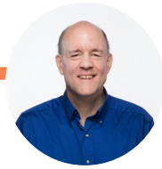
BY RICK WOOD EDITOR OF MF