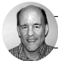
by Rick Wood Editor of MF

Can you feel it? Can you see it spreading across the globe like a deadly plague? The hatred for and intolerance of Jesus followers and their biblical beliefs and values is growing. The barbarians of ISIS are but the most extreme example of this growing intolerance that is enveloping the world. Open Doors reports, “While the year 2014 will go down in history for having the highest level of global persecution of Christians in the modern era, current conditions suggest the worst is yet to come.”