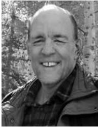
RICK WOOD / EDITOR, MISSION FRONTIERS

We live in remarkable times. Knowledge is growing at an exponential rate in every field of endeavor. One article I googled noted: