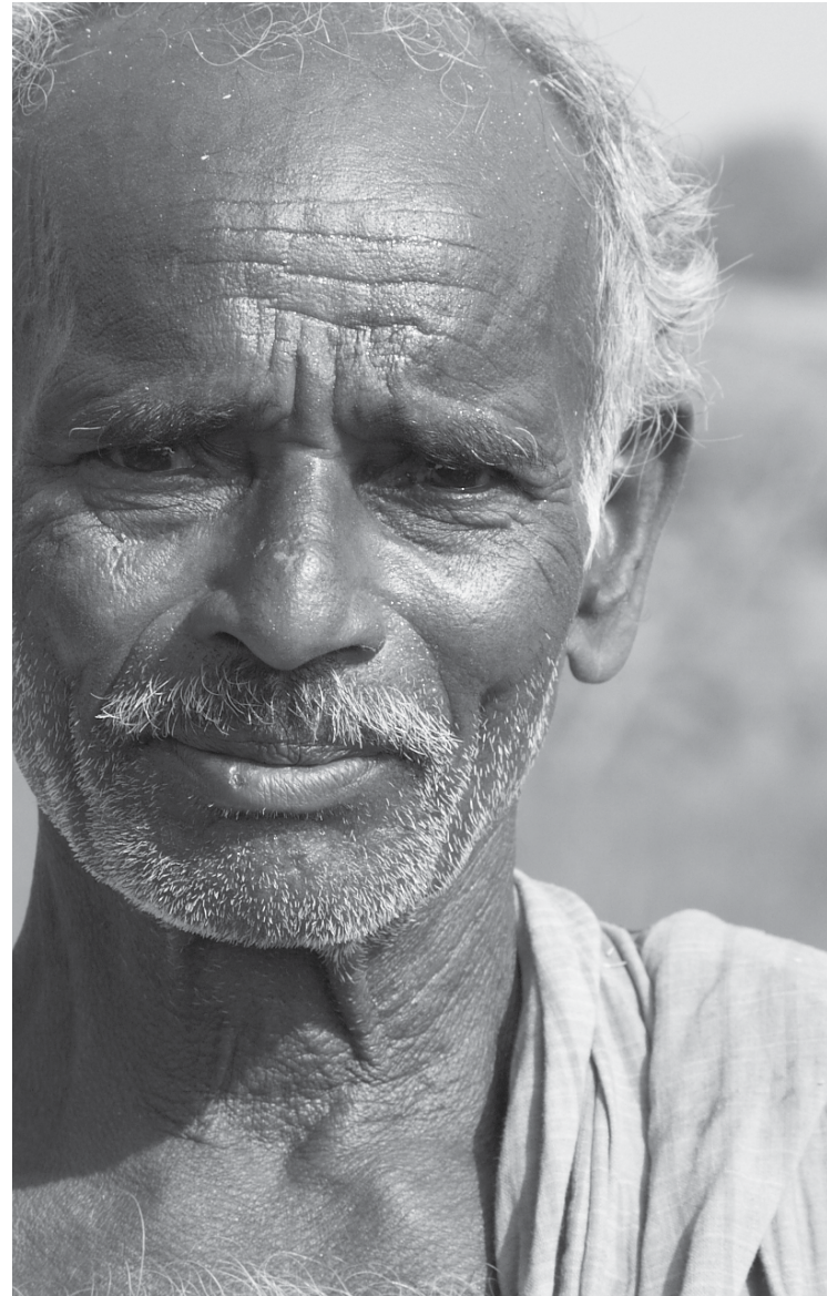
Missionaries to these Regions