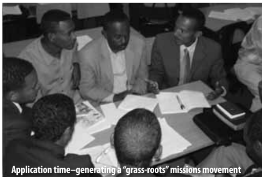
Application time—generating a “grass-roots” missions movement

The fourth component is the Eight Best Practices of Doing Missions through Local Churches . We taught that these practices are proven experiences in America and other parts of the world, and we want them to pray and think through how they could be contextualized within the Ethiopian context. The eight best practices are: prayer, missions task force, strategy, faith promise giving, missions conferences,