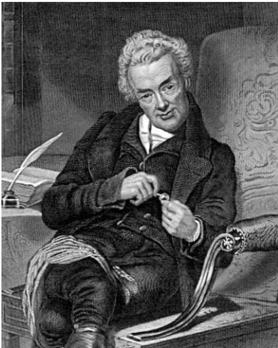
William Wilberforce, powerfully used of God to end the Atlantic Slave Trade and better the lives of millions in 19th Century Britain.