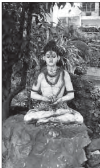
A HINDU NATION? India is 75 percent Hindu. A vocal minority, vehemently opposed to conversion is perceived as being in accord with the leading party in India’s governing coalition, making some question the depth of India’s commitment to religious freedom itself.

of the Christian faith as the religion of the white man. “Today in India, Islam is growing faster than any other religion. When the Muslims have their conventions, they don’t bring a great man from Saudi Arabia to preach,” he said “Why do we need to do that?”