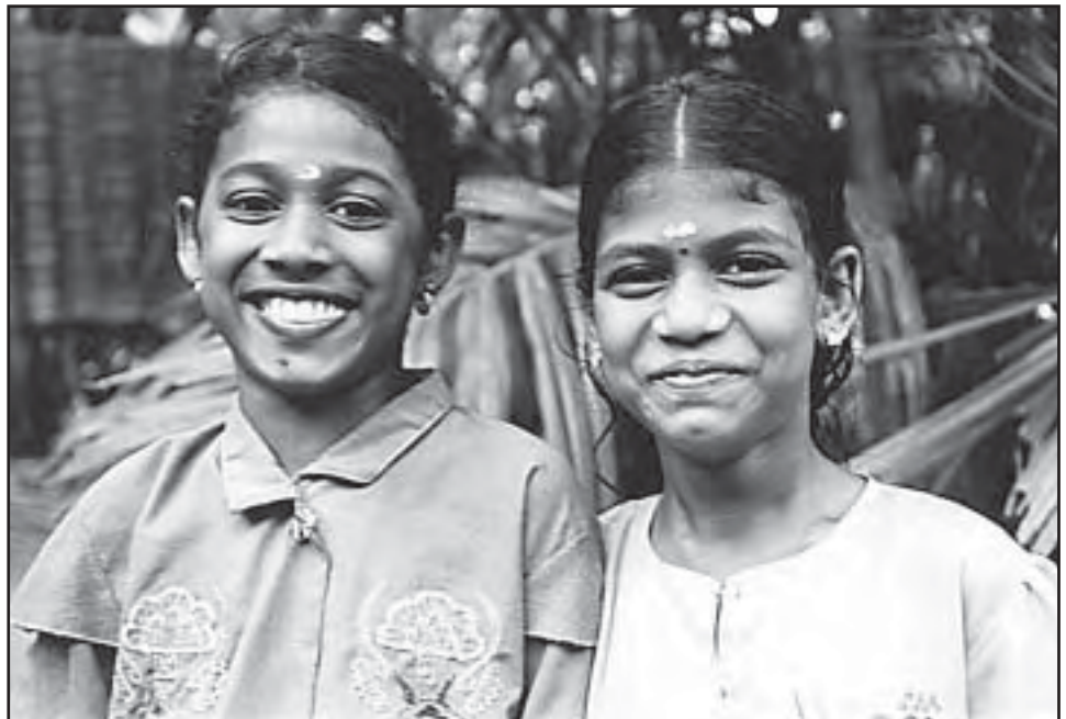
THE FACE OF THE UNREACHED: India tops the list of Joshua Project's unreached peoples list. The believing community it does have has been subject to the greatest violence since independence.