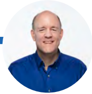
BY RICK WOOD EDITOR OF MF