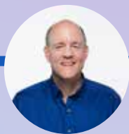
BY RICK WOOD EDITOR OF MF