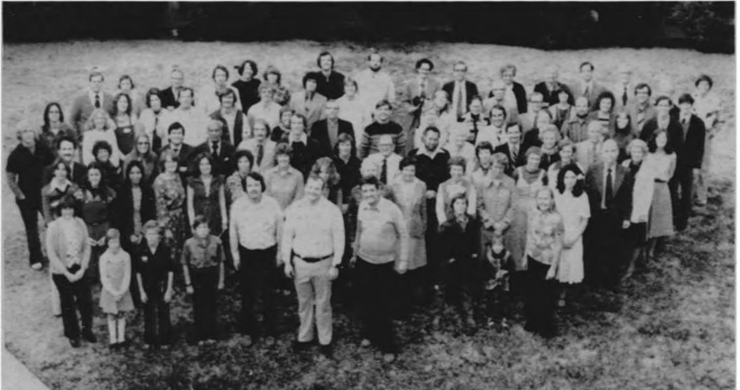
Shown in the picture are personnel of USCWM and WCIU as well as those of associated entities and organizations.

THE BULLETIN OF THE UNITED STATES CENTER FOR WORLD MISSION JAN-FEB, 1979 VOL 1:1