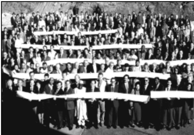
Seen here are the 262 Christian leaders from 140 ministries in 77 countries that gathered in Colorado Springs in Nov. 1995 to launch Joshua Project 2000. They are holding the first Joshua Project list of 1,739 peoples.

The information gathering continued as the AD2000 office launched a global survey of mission agencies and their activities among the Joshua Project peoples of the world. This survey of over 450 mission organizations and 350 other organizations and individuals gathered 22,000 pieces of information. This survey was published and released at GCOWE '97 in South Africa as The Global Guide to Unreached Peoples . It not only included information on the